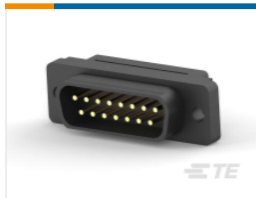
TE Part # CAT-AM7-H3 IDC D-Sub: Plug Assembly, Low Profile, Signal, 2.77 mm